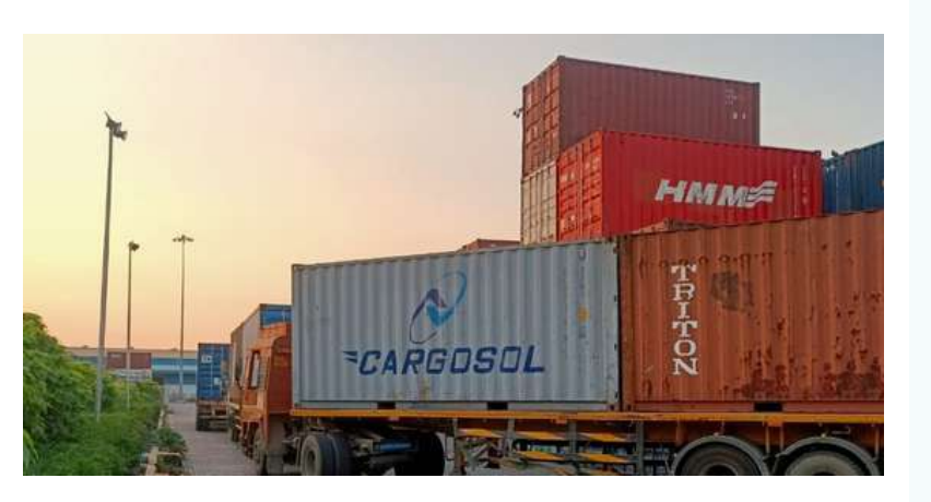
Cargosol Newsline presents to you the latest developments in the supply chain industry

We will continue to be driven by our values of consistent efficiency, commitment, compliance and business ethics to serve our loyal customers.