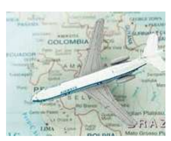
AIR CARGO CARRIERS GET TEMPORARY SEVENTH FREEDOM RIGHTS ACROSS LATIN AMERICA