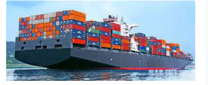
Cargosol Newsline presents to you the latest developments in the supply chain industry

Our team takes pride in creating an experience of Customer Satisfaction